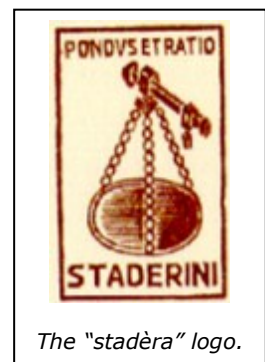
The "stadèra" logo.